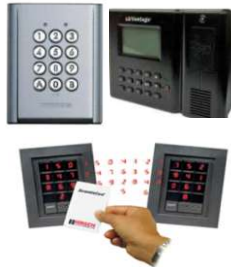
Access Control System