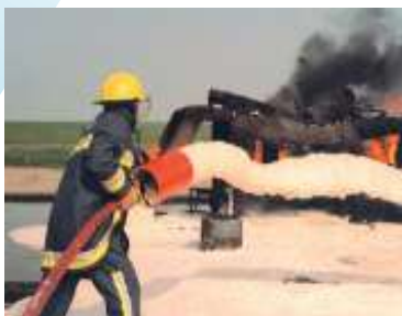
Foam base suppression system