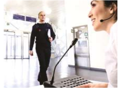
Public Announcement (PA) System