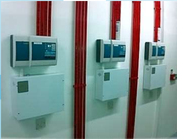
VESDA - Early Warning System