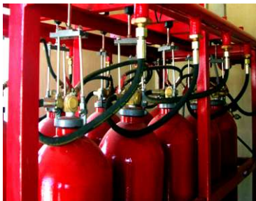
FM200 / Novac0123 / Co2 Flooding system