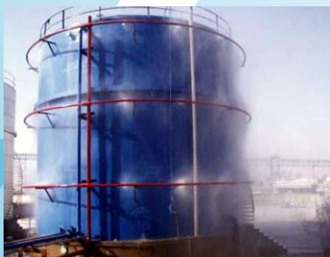
Water Mist System