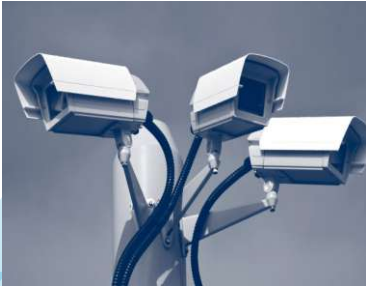
CCTV / IP Camera System