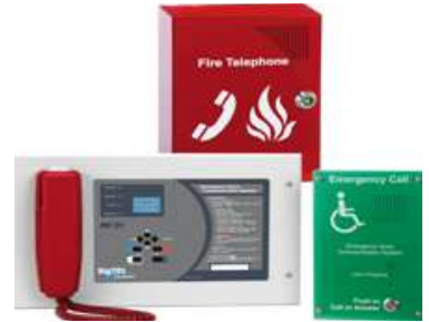
FF Talk Back System