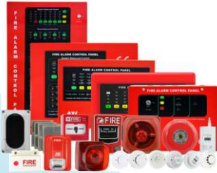
Addressable Fire Alarm