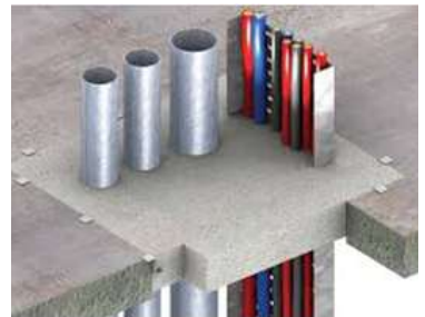
Fire Rated Shaft Closing