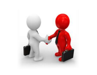
Liasoning – Fire NOC