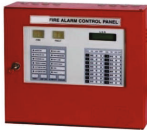
Conventional Fire Alarm