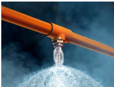
Fire Sprinkler system