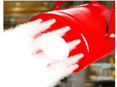
Dry Sprinkler Aerosol (DSPA)