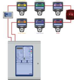
Gas Detection System