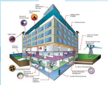
Building Management (BMS) System