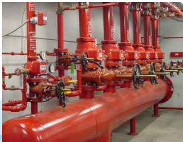
Fire Hydrant system