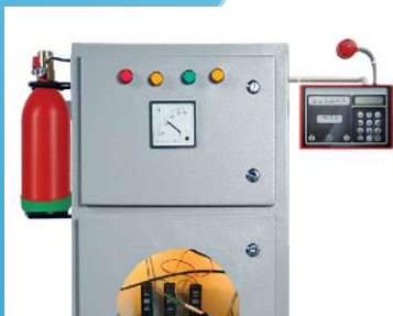
Tube Supression System